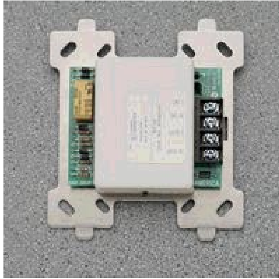
Back side of a DCP-SCI

The contractor shall furnish and install where indicated on the plans, the Hochiki DCP-SCI short circuit isolator. The modules shall be UL listed compatible with Hochiki Digital Communications Protocol (DCP) supporting control panel loops. The isolator module must be suitable for mounting in a standard 4" square electrical box. The isolator module must provide a yellow LED for indication of status.